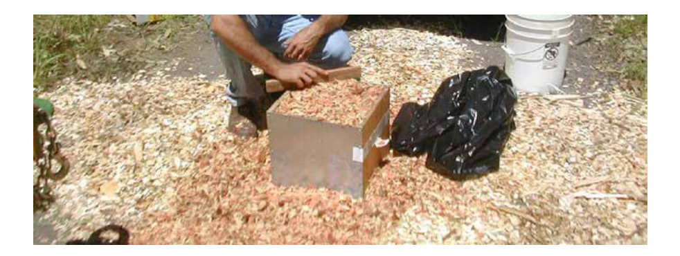
Figure 2. Measuring wood chips bulk density in Hawaii, USA (Turn et al. 2005)

Bulk density (dry and wet), particle size distribution, ash content, volatile matter content of bole wood samples and calorific value were assessed. The ultimate analysis evaluated the elements as Nitrogen, Carbon, Sulphur, and Chlorine.