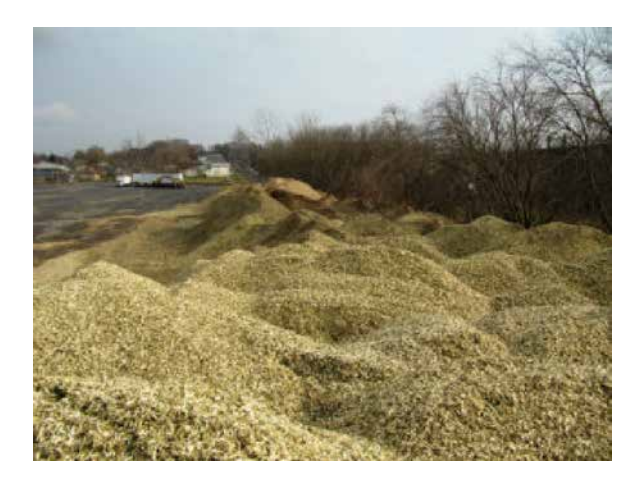
Figure 1 . Willow biomass chips for temporary storage in Upstate NY, USA (Eisenbies et al. 2008)

Eisenbies et al. (2016) studied the storage of willow stand chips collected by an unmodified New Holland FR9080 harvester, equipped with a New Holland 130FB coppice header near Groveland, New York. Changes on moisture content, ash content and calorific value were assessed during several months of storage. Chip quality change during the first two months of storage was minimal while it did not vary highly over a longer period. In a study by Turn et al. (2005) in plantations on the islands of Kauai and Hawaii wood chip samples (Figure 2) were collected from slab wood produced from sawmill operations. Several species including Eucalyptus grandis , ironwood, waiwi, tropical ash, and Moluccan albizia trees were chosen to sample randomly from the plantations.