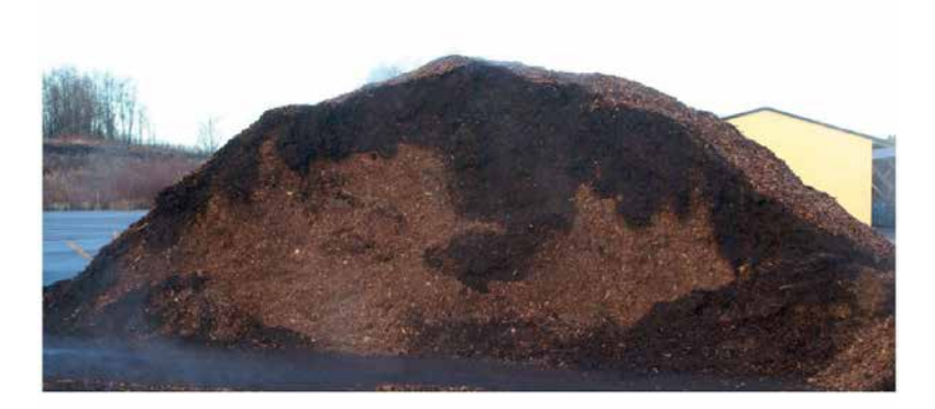
Figure 4. Uncovered cross section of wood chips pile in Sweden (Wästerlund et al. 2017)

content is critical. He used several methods/tools such as electric capacitance (CAP), magnetic resonance (MR), near infrared spectroscopy (NIR), and X-ray technologies for moisture content measurement. MR was not impacted by fuel type and had highest accuracy while CAP resulted in the lowest accuracy in the trials. Ash content and particle size distribution could be measured using an X-ray tool. For particle size measurement the tool required calibration before usage to ensure high level of accuracy.