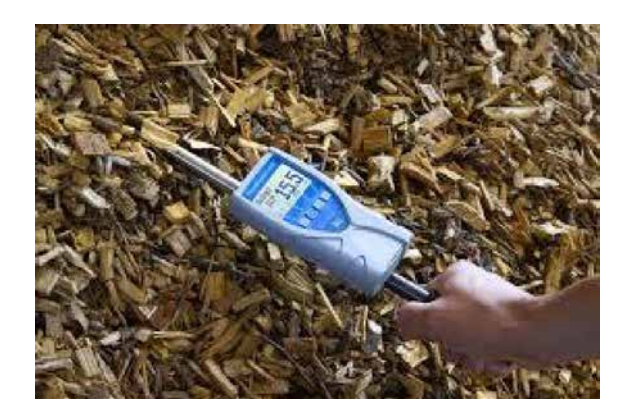
Figure 5. Measuring moisture content of wood chips in Australia (Boucher, 2019)