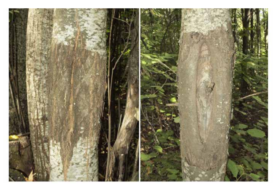
Figure 3. Closed necrosis on chestnut stems in PSP Belasitsa (2023)

for biological control to C. parasitica by an artificial inoculation with a hypovirulent strain EU-12 was carried out in 2021 on infected trees in three sample plots in Belasitsa and Pirin mountains (Filipova, 2021).