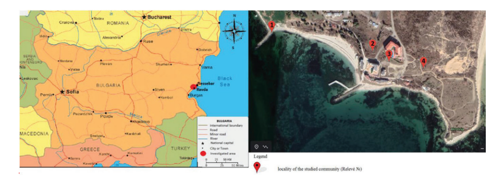
Figure 2. Map of the study area and the localities (1-4) of the studied plant community. (Map data 2020 (C) Google)