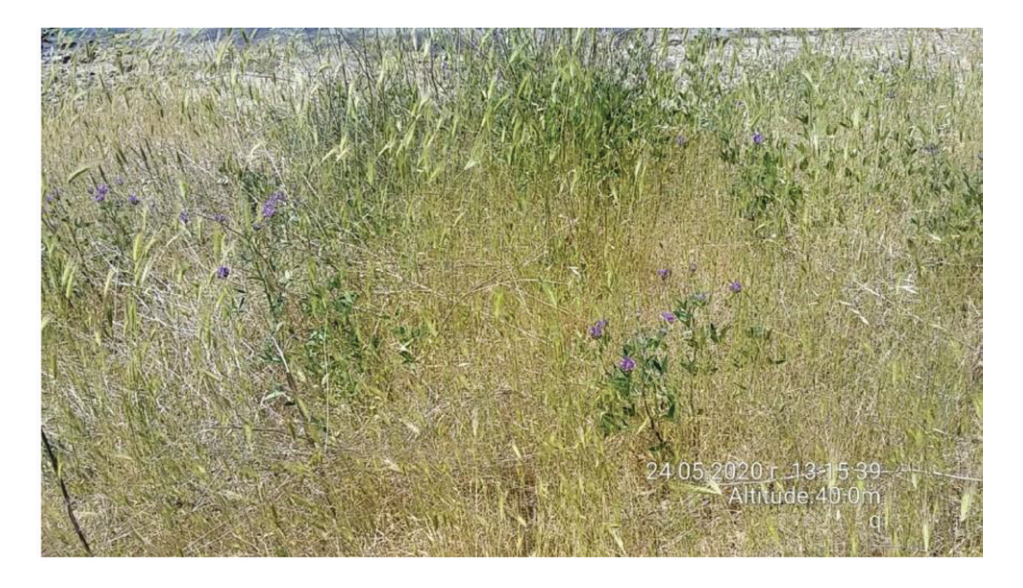
Figure 1. General view of the studied plant community.

are situated the large coastal lakes Burgas Lake, Mandrensko and Atanasovsko Lakes. Only one higher part stands out by the sea – the hill Vurli briag (209 m a.s.l). The soil cover is diverse due to the differences in the basal rock, relief, climate and vegetation. The podzolic cinnamon brown soils and Vertisols have dominant distribution. In addition, some azonal soil types are also found along the sea coast. The study area is situated in the southern part of the Black Sea climatic area, which is formed by the dominance of two climate factors: atmospheric circulation and the influence of the Black Sea and partly – of the Mediterranean Sea. The average annual temperatures reach up to 13.3°C. The average January temperature is between 1 and 2°C. In