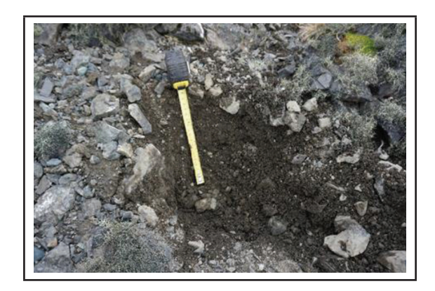
Figure 2. Sampling site PB1

71 m a.s.l. The soil has a greyish-black colour 10YR 4/2 and two layers with varying depth can be distinguished. Location is covered by mosses, lichens and Deschampsia antarctica in between the rock sediments. Remnants are mixed and represent medium decomposed organic horizon (Fig. 2).