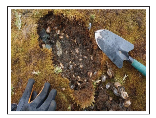
Figure 3. Sampling site HPP2

The sampling location is situated on a small cove in the foothill of Hesperides hill (7 m a.s.l.) around 20 m inland (Fig. 3). Under a thick moss layer, the soil formed is reaching a depth of 2-3 cm and mixed with many remnants of mollusks (Patella).