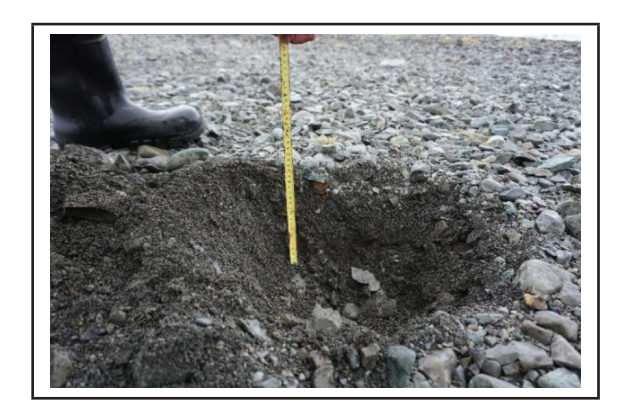
Figure 5. Sampling site JD1

That place is a small, nearly closed bay in low tides. The terrain is rocky and on the south of the bay, the coast has cape-like shape (Fig. 5). The sample is collected on the second marine terrace at about 1 m a.s.l., which is covered by many marine and slope sediments.