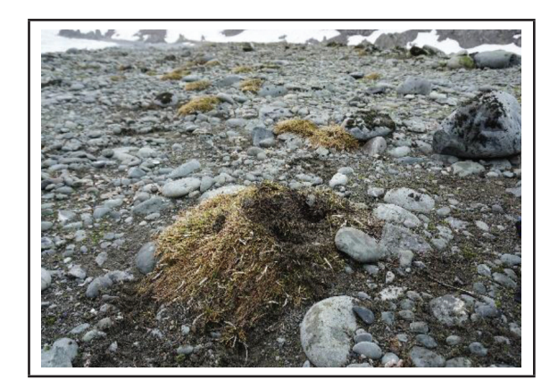
Figure 6. Sampling site CA1