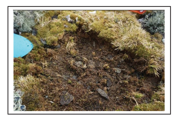
Figure 4. Sampling site PUN-H1