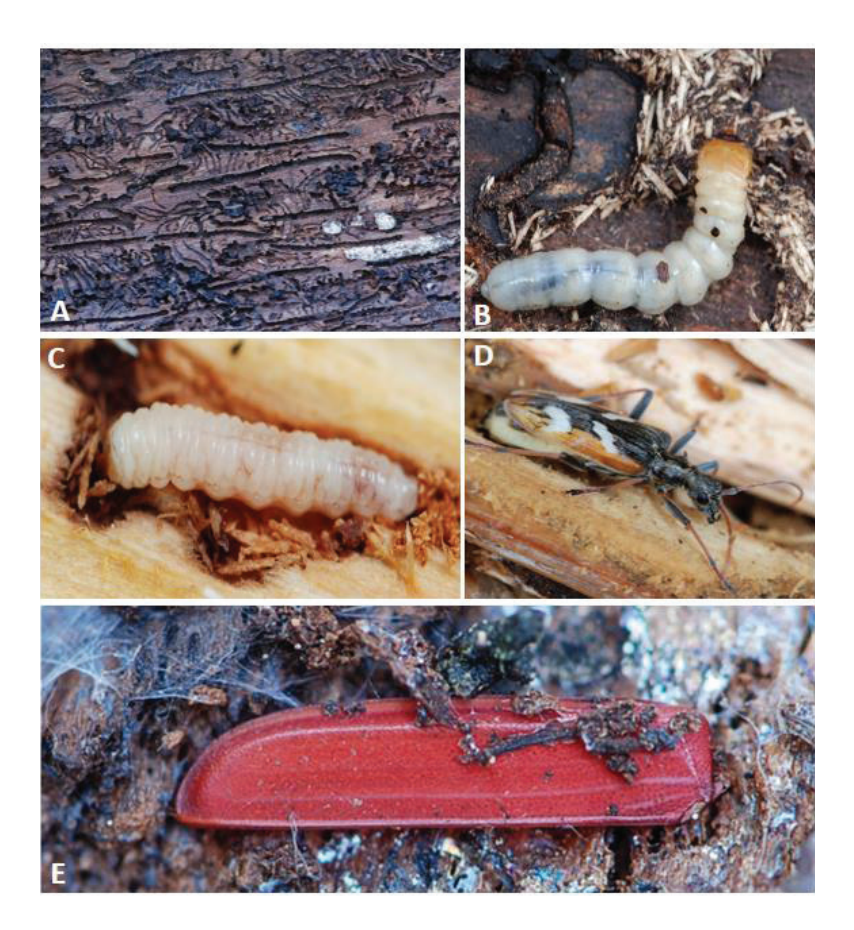
Figure 2. Insects found in Gornata Koria and Chuprene Reserves: A – larval galleries of Ips typographus ; B – larva of Monochamus sp.; C – larva of Pissodes sp.; D – imago of Rhagium bifasciatum ; E – elytra of Cucujus cinnaberinus .

Calliteara pudibunda was found on the leaves of raspberries ( Rubus idaeus L.). The species is associated trophically with deciduous trees and shrubs.