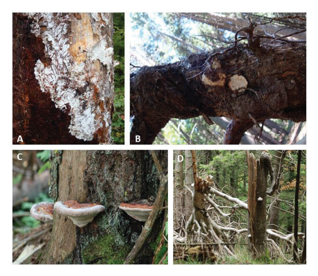
Figure 3. Parasitic fungal pathogens established in Gornata Koria and Chuprene Reserves: A – Armillaria sp.; B – Heterobasidion annosum ; C – Fomitopsis pinicola ; D – Fomes fomentarius .

and roots were very common. In 70% of the Norway spruce trees, wood rot was found. It was situated in the central part of the stems and was caused by the root fungus ( H. annosum ). In beech trees, a large percentage (75%), of the stems was rotting in the central part, which was due to F. fomentarius .